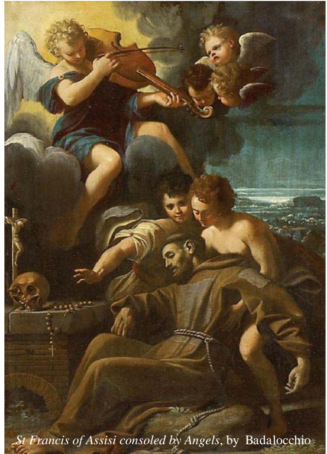
St Francis of Assisi consoled by Angels, by Badalocchio

Please consider spending some time with our Lord in the Blessed Sacrament, especially during this year of the Real Presence. Our Adoration Chapel is open daily from 6:00 AM—9:00 PM.