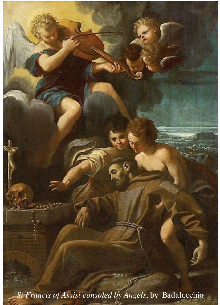
St Francis of Assisi consoled by Angels, by Badalocchio

Please consider spending some time with our Lord in the Blessed Sacrament. Our Adoration Chapel is open daily from 6:00 AM—9:00 PM.