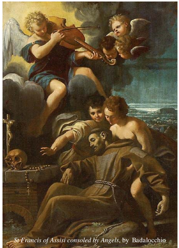
St Francis of Assisi consoled by Angels, by Badalocchio

Please consider spending some time with our Lord in the Blessed Sacrament. Our Adoration Chapel is open daily from 6:00 AM—9:00 PM.