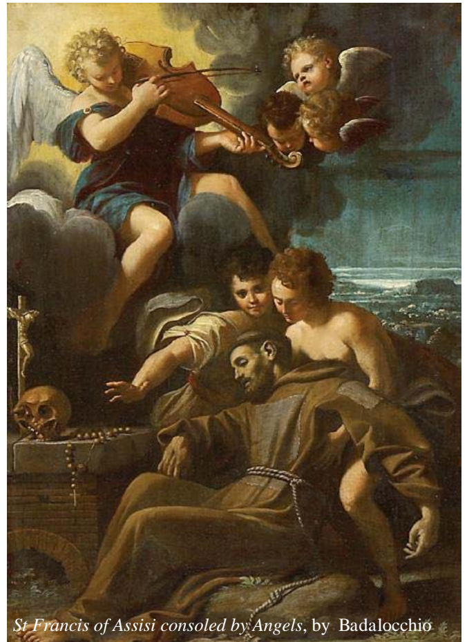
St Francis of Assisi consoled by Angels, by Badalocchio

Please consider spending some time with our Lord in the Blessed Sacrament, especially during this year of the Real Presence. Our Adoration Chapel is open daily from 6:00 AM—9:00 PM.