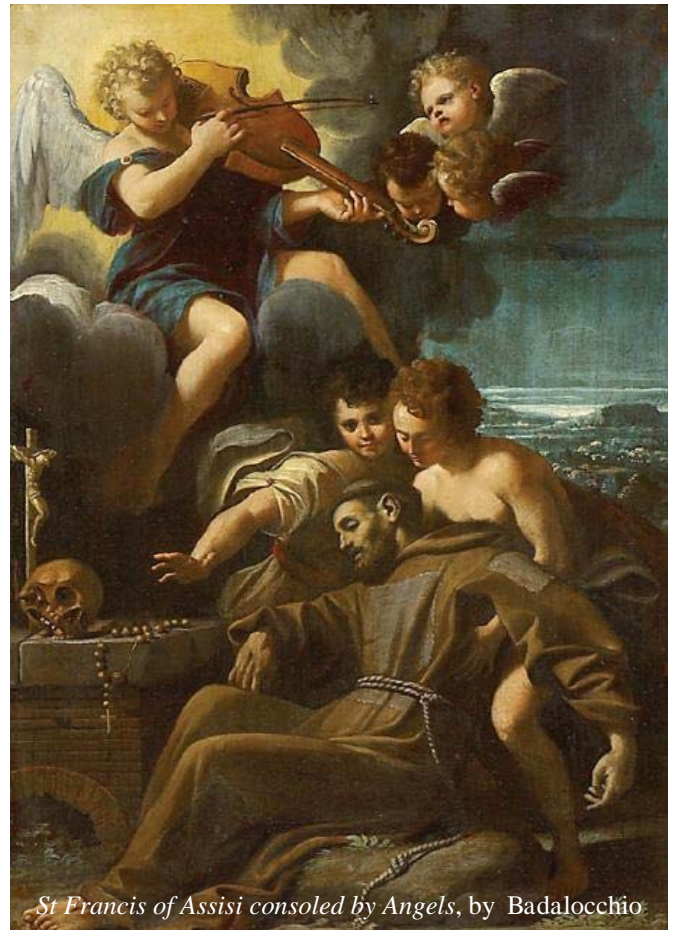
St Francis of Assisi consoled by Angels, by Badalocchio

Please consider spending some time with our Lord in the Blessed Sacrament, especially during this year of the Real Presence. Our Adoration Chapel is open daily from 6:00 AM—9:00 PM.