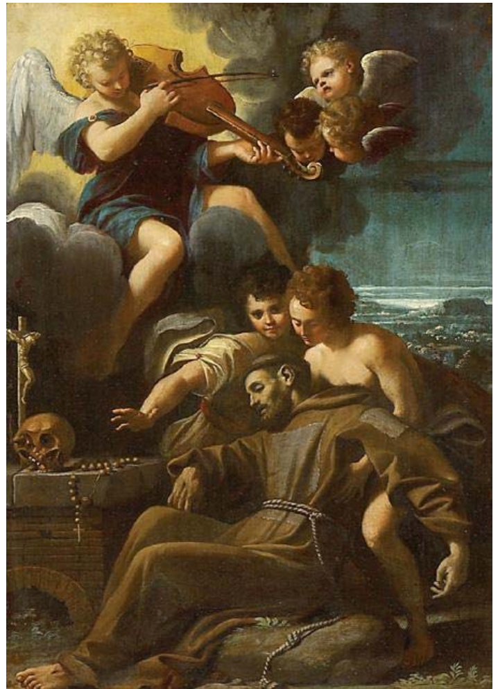
"St. Francis of Assisi Consoled by Angels" by Badalocchio

Please consider spending some time with our Lord in the Blessed Sacrament. Our Adoration Chapel is open daily from 6:00 AM—9:00 PM.