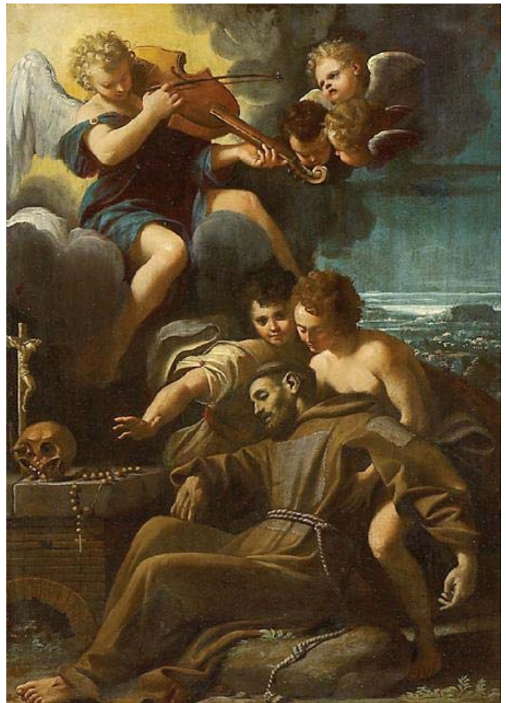
"St. Francis of Assisi Consoled by Angels" by Badalocchio

Please consider spending some time with our Lord in the Blessed Sacrament. Our Adoration Chapel is open daily from 6:00 AM—9:00 PM.